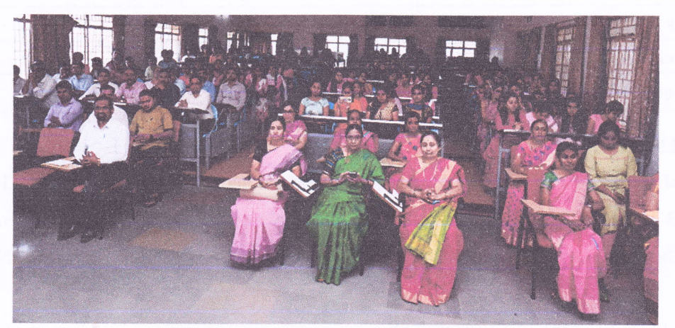
Staff invitees and students in the function hall