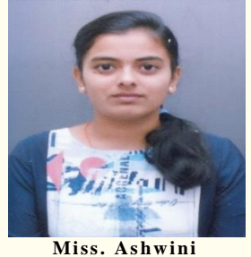
Shettimani 1. Creators Technology Solutions, Nagpur, Maharashtra